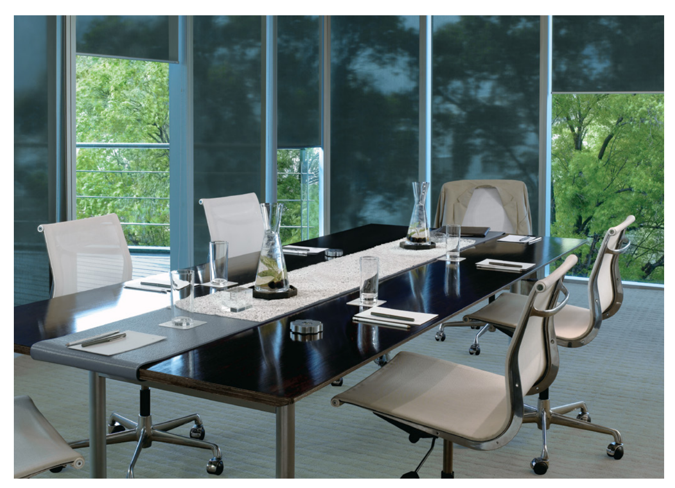
When considering window coverings, it is advised to specify a performance fabric that has the ability to reduce the sun's glare while maintaining views through when in use.

In this sense, while glass may look aesthetically pleasing on the exterior, it can actually have negative effects on an interior, such as excess heat and fabric fading from UV radiation. In a bid to counteract these negative effects, performance fabrics – specifically when used in window coverings - provide functional qualities such as durability, UV protection, comfort and thermo-regulation.<sup>3,4</sup> In this whitepaper, we look at how specifying high-quality performance fabrics can have a positive impact on design by combatting the issues that come with utilising glass in buildings.