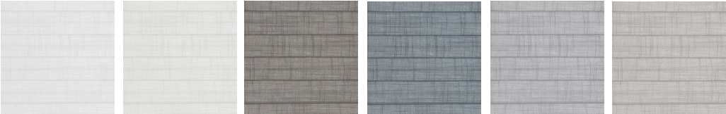
0100 Snow White 0300 Beach Beige 0600 Moon Rock 0700 Stone Blue 0900 Pebble 1000 Light Grey