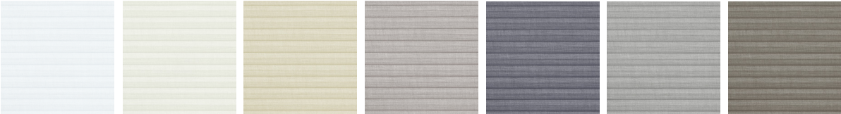
5359 Snow White