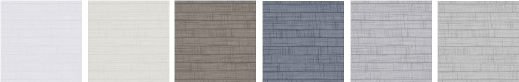
0100 Snow White