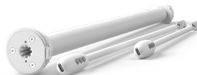
Basics Wand Motor & Wands (600mm/900mm)