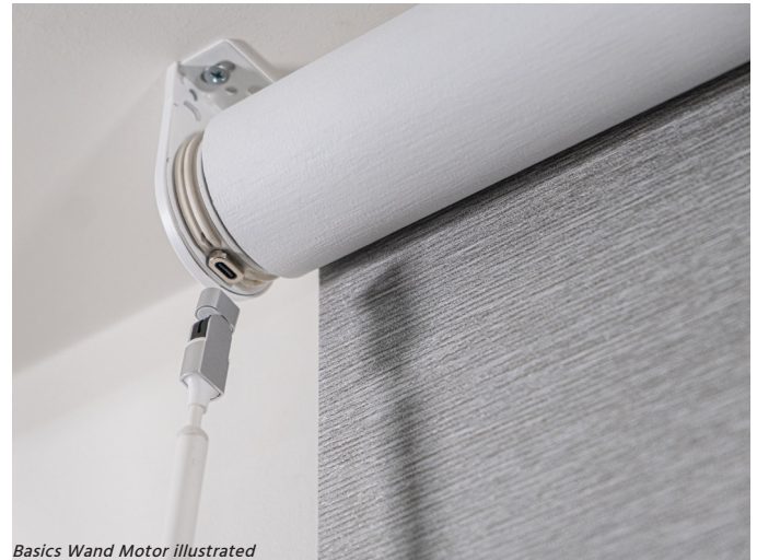
Basics Wand Motor illustrated

The Basics Wand Motor & RF Motor is suitable for residential use.