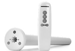
Basics RF Motor & 5CH Remote