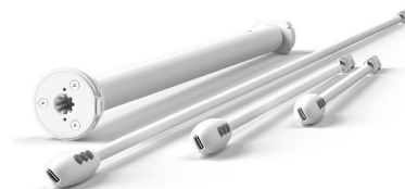
Basics Wand Motor & Wands (600mm/900mm/1200mm)